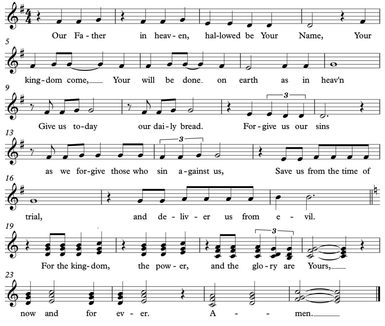
Eric Wyse ©2000 Wildgrove Music (BMI)